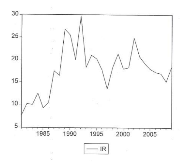
Figure 1b. Movement of IR

Fig. 1a and Fig. 1b further reveals the trend or movement in both the market capitalization (MCAP) and lending/or interest rate (IR) over the period under study. Fig. 1a shows that market capitalization was low in the Pre – SAP years; but some years after, the implementation of the SAP, specifically from 1994, the level of market capitalization in the Nigerian Stock Exchange increased. Interestingly, one would notice that the increase in market capitalization was more noticed from 1999, and by 2003 – 2009, market capitalization became higher than ever. It should be noted that this period, beginning from 1999 marks the outset of the new civilian regime in Nigeria. Thus the increase in market capitalization may be attributable to the restoration of investors' confidence in addition to programmes introduced by the Government of Nigeria (for instance, the National Economic Empowerment Development Strategies – NEEDS). However, by the end of 2007, one would also notice a downward trend in market capitalization. This may be due to the crash experienced in the stock market as a result of the Global Financial Crisis experienced during that period.